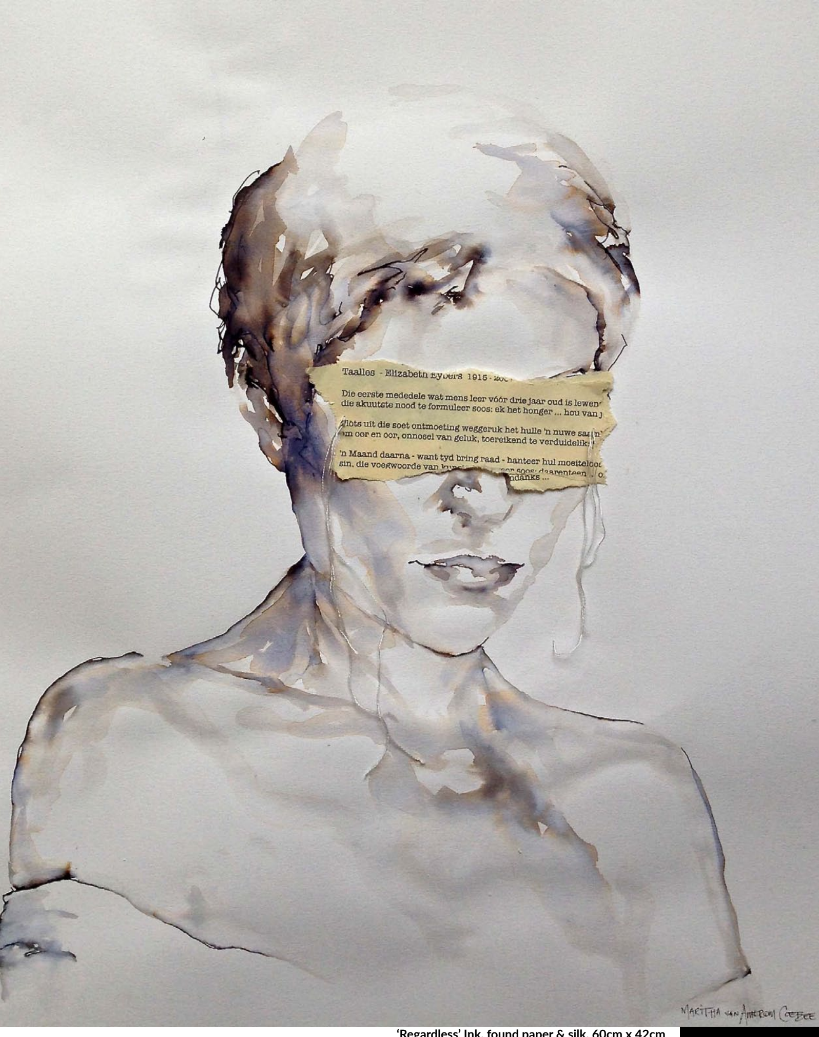
'Regardless' Ink, found paper & silk, 60cm x 42cm