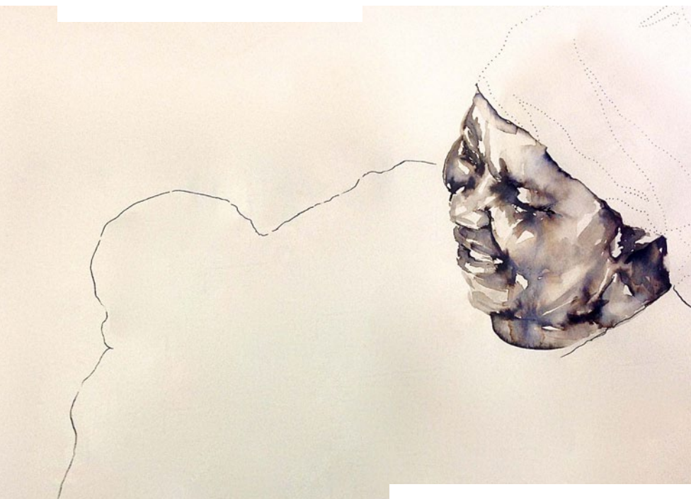
'Angel Pauline', Ink & Blind embossing, 42cm x 60cm

I am a South African born artist with European roots. My earliest memories as young artist transport me back to my German grandmother, a Fine Art Graduate from the University of Graz. Apart from input from numerous well-known artists throughout my career, my Grandmother's passion for art can still be singled out as one of the biggest influences in my love for art.