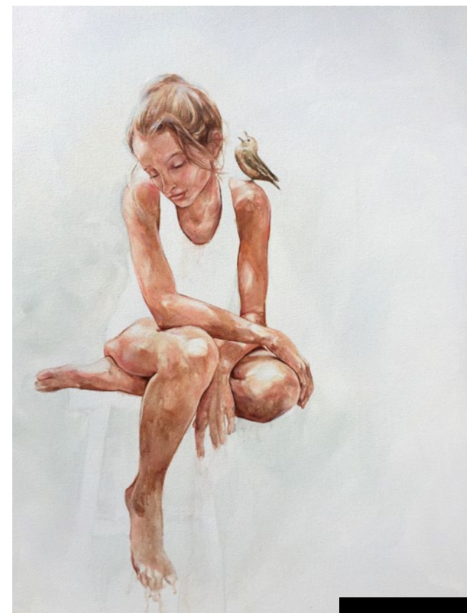
'Like a bird III', Oil on canvas, 90cm x 70cm

I need to be true to myself and to my work, bold enough to explore, unravel and discover - and at the end of the day courageous enough to share that with the world. I experience the translucency of ink as a very honest medium. Often the real challenge lies in the ability to see the emotional and the imperceptible, and to give it form, life and a sense of tangibility.