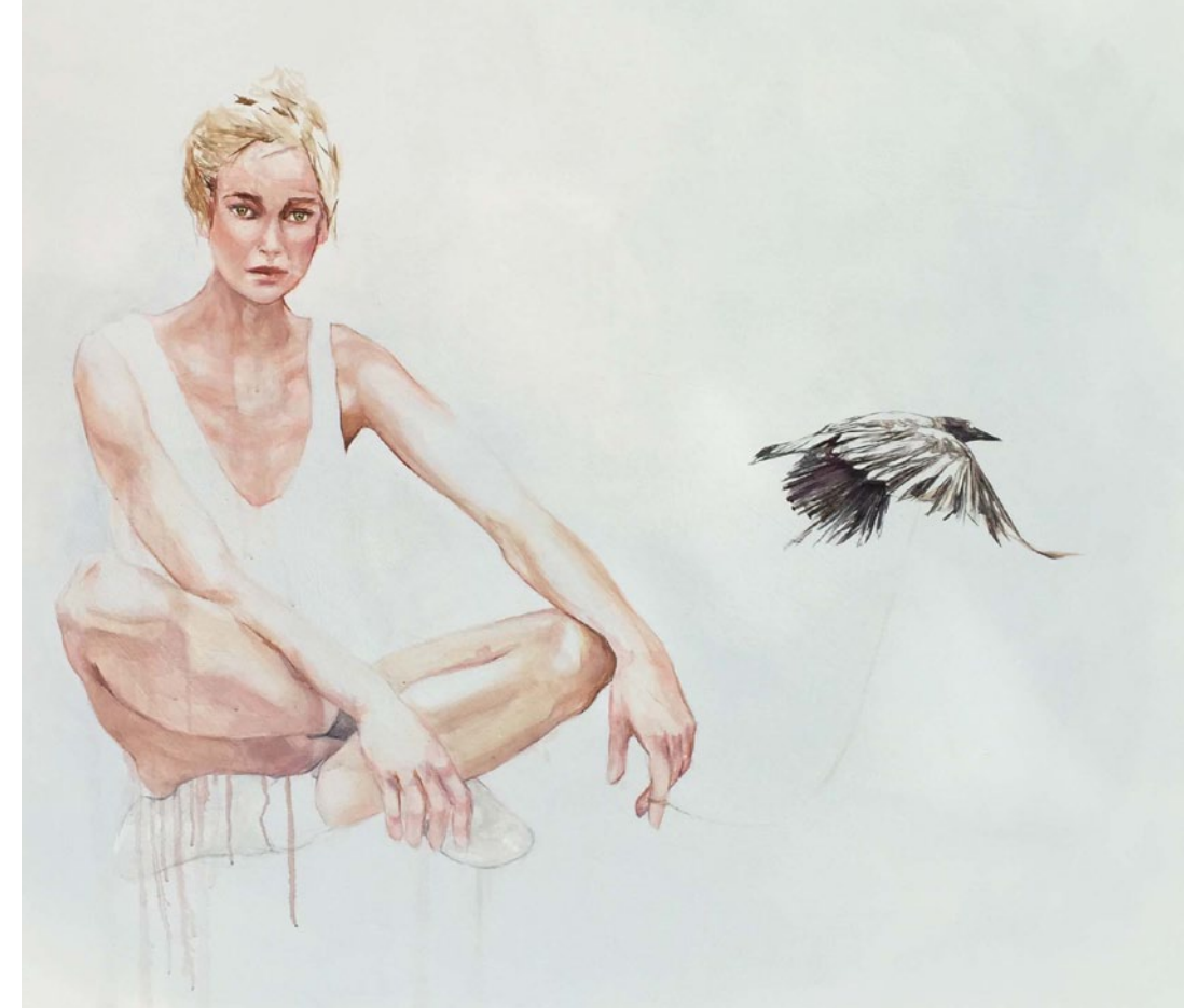
'Like a bird I', Oil on canvas, 100cm x 100cm

When it comes to my style, I believe 'less is more'. I like word play when it comes to the titling of my work and I would often leave parts of the work underdone, allowing the viewer to complete the story of their current space of being. The most important thing to me as an artist, apart from technical skill, is honesty.